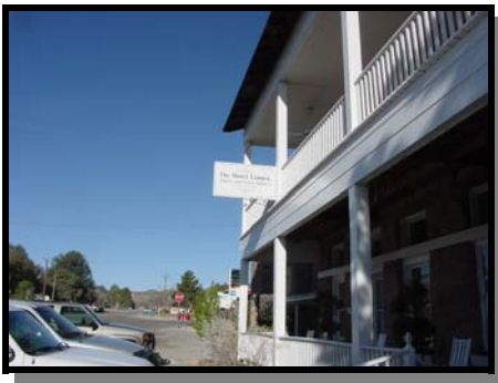
This is Hotel Limpia Front Entrance.

My Wife and I left Midland, Texas on Friday, March 5, 2004, in the evening around 5:30 PM after having ditched the kids with friends to stay with for the weekend... We traveled the old familiar course of Interstate Highway 20 West right into a super sonic head wind that had been plaguing Western Texas all week. At around 7:00 PM we stopped in Pecos, Texas for a supper at the local Dairy Queen. While we ate, it got dark and when we left the wind had died down some. Onward we traveled down Hwy 17 South out of Pecos through towns of Saragosa, Texas and Balmorhea, Texas where I made a quick phone cell call to information got the number of the Hotel Limpia where we made arrangements to stay for the night. We arrived there at around 8:45 PM. This beautiful old Hotel was restored in 1978 from it's 1912 beginnings. The rooms were authentic in every detail except for the TV and the modern lights you would not know what time period you were in.