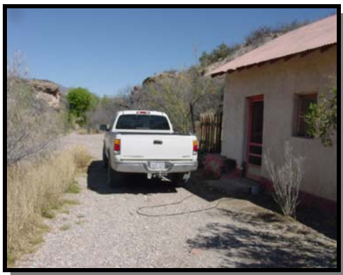
We had rented the "El Presidente" Suite which was the only private cabin with its own tub.