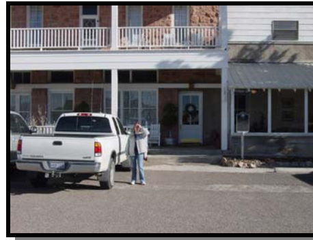
So we left Ft. Davis and the Hotel Limpia.

We say goodbye to Ft. Davis and then head South down Hwy 17 to the small town of Marfa, Texas where get on FM 2810 which runs out of asphalt after 32 miles. Then on another 21 miles of off road to the Chinati Springs. The Chinati Springs are located just West of the great Chinati Mountains and about 6 miles or so North of the small border town of Ruidosa, Texas. We got there around 1:15 PM on Saturday March 6, 2004.