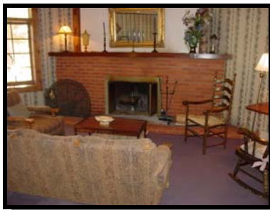
This is Hotel Limpia Lobby.