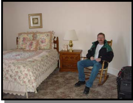
This is me relaxing in the room right before we left. Do I look relaxed?