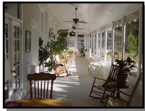
This is Hotel Limpia Sun Porch.