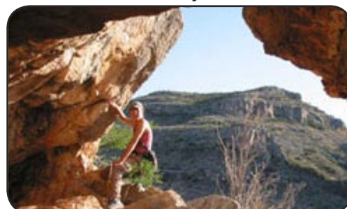
West Texas caving.

The 2009 International Congress of Speleology promises attendees an outstanding Congress and the opportunity to experience some of the country's best "karst horizons."