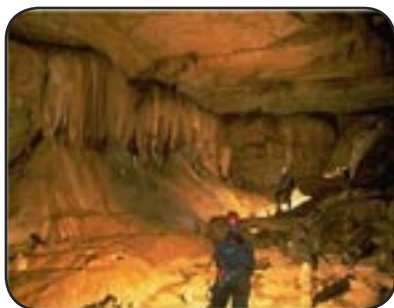
Cave in the Cumberland Plateau of Tennessee.

I look forward to meeting many cave explorers and scientists in Kerrville, USA, in July 2009.