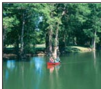
Canoeing in Kerrville.