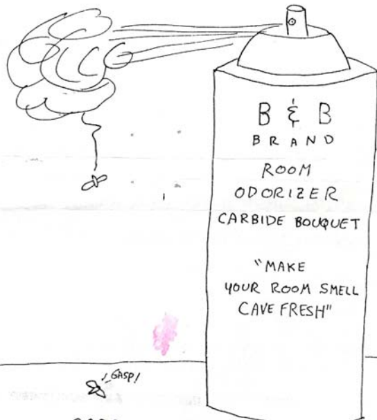
CARBIDE SCENTED ROOM "FRESHENER"

LITTLE KNOWN (AND LESS APPRECIATED) SPELEO -INVENTIONS #126: