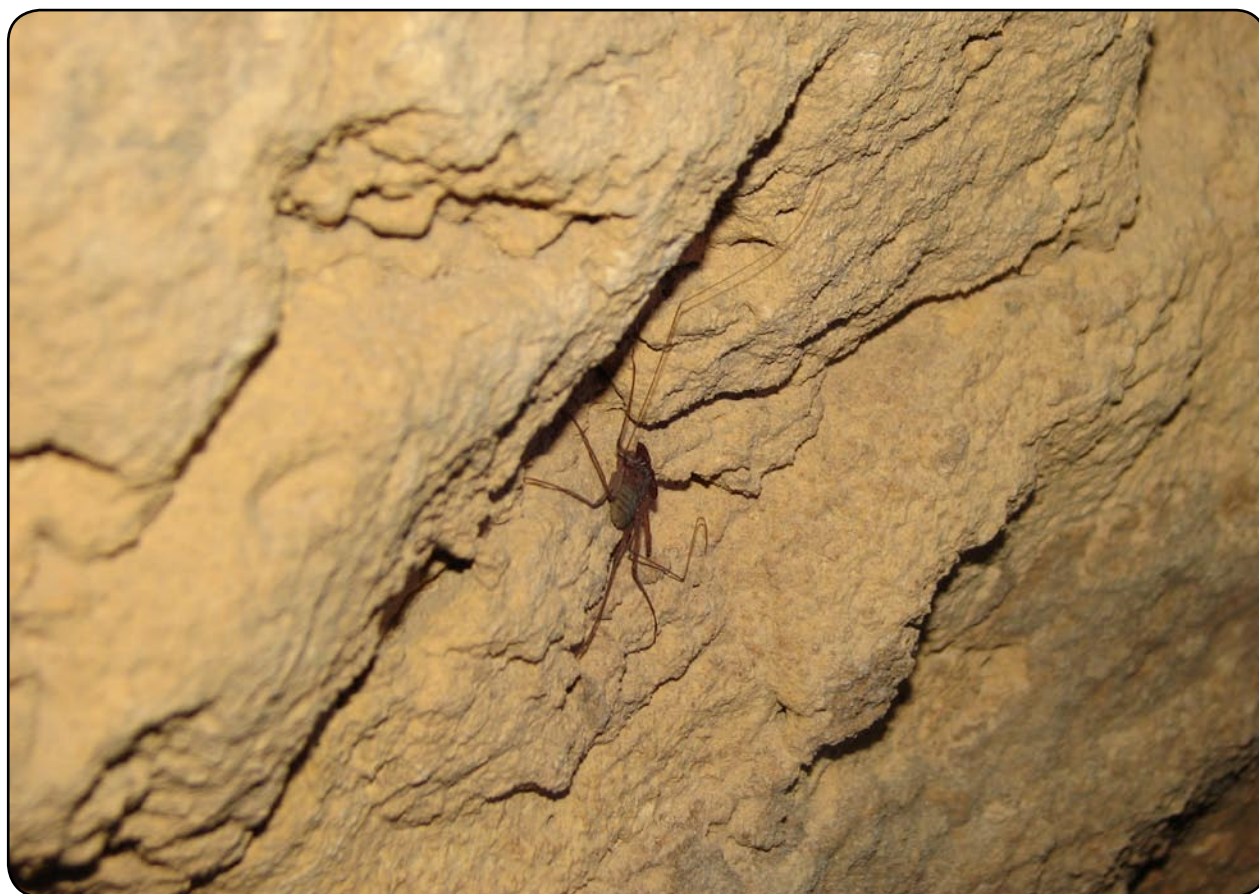
Amblypygi as seen in Amazing Maze. Cool little bug.